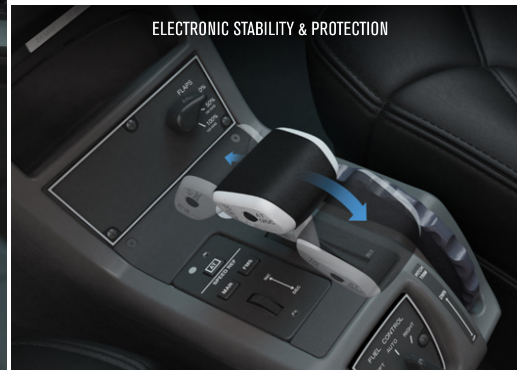
ELECTRONIC STABILITY & PROTECTION

One of the many hallmarks of Cirrus Aircraft innovation is our constant improvement of the flight experience – and Cirrus Perspective Touch+™ by Garmin® leads the way. As the center of the pilot experience, Perspective Touch+ integrates the sophisticated systems in the Vision Jet into one intuitive interface. Situational awareness is increased via an easy to use system, allowing attention to be focused elsewhere. Combined with autothrottle, which allows an operator to program an entire flight profile; including climbs and descents results in a level of enhanced automation never before seen in a Personal Jet.