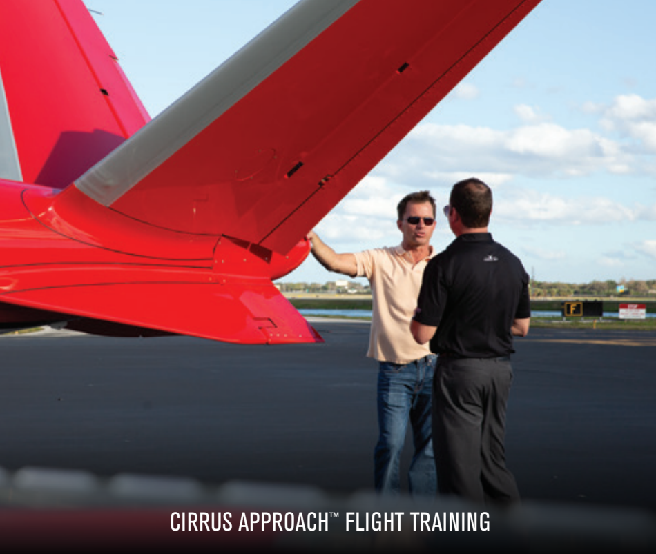
CIRRUS APPROACH™ FLIGHT TRAINING