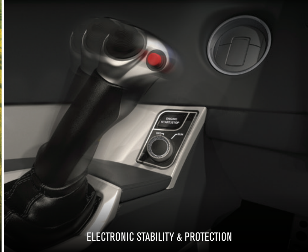
ELECTRONIC STABILITY & PROTECTION