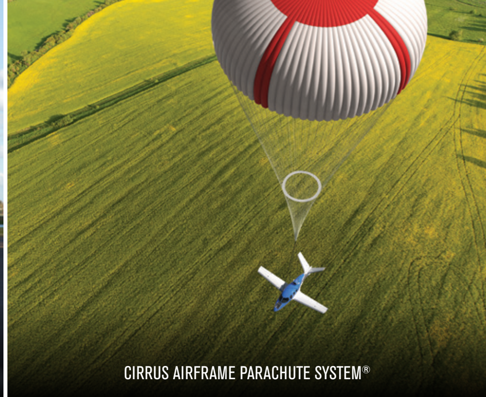
CIRRUS AIRFRAME PARACHUTE SYSTEM®