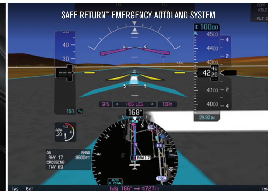
SAFE RETURN™ EMERGENCY AUTOLAND SYSTEM