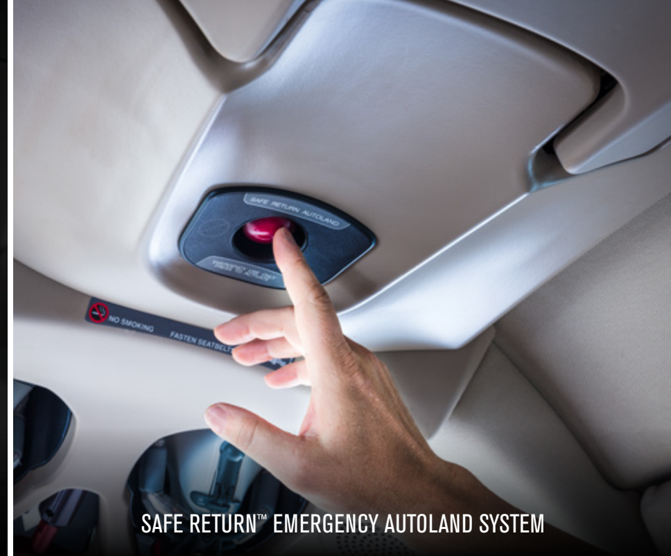
SAFE RETURN™ EMERGENCY AUTOLAND SYSTEM